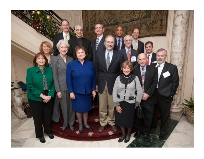
The Commonwealth Fund Commission on a High Performance Health System