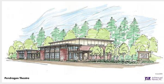
Proposed new theatre building concept design