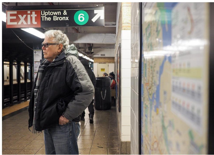
Photo by Heather Clayton Colangelo https://www.exceedingexpectations.nyc/hank